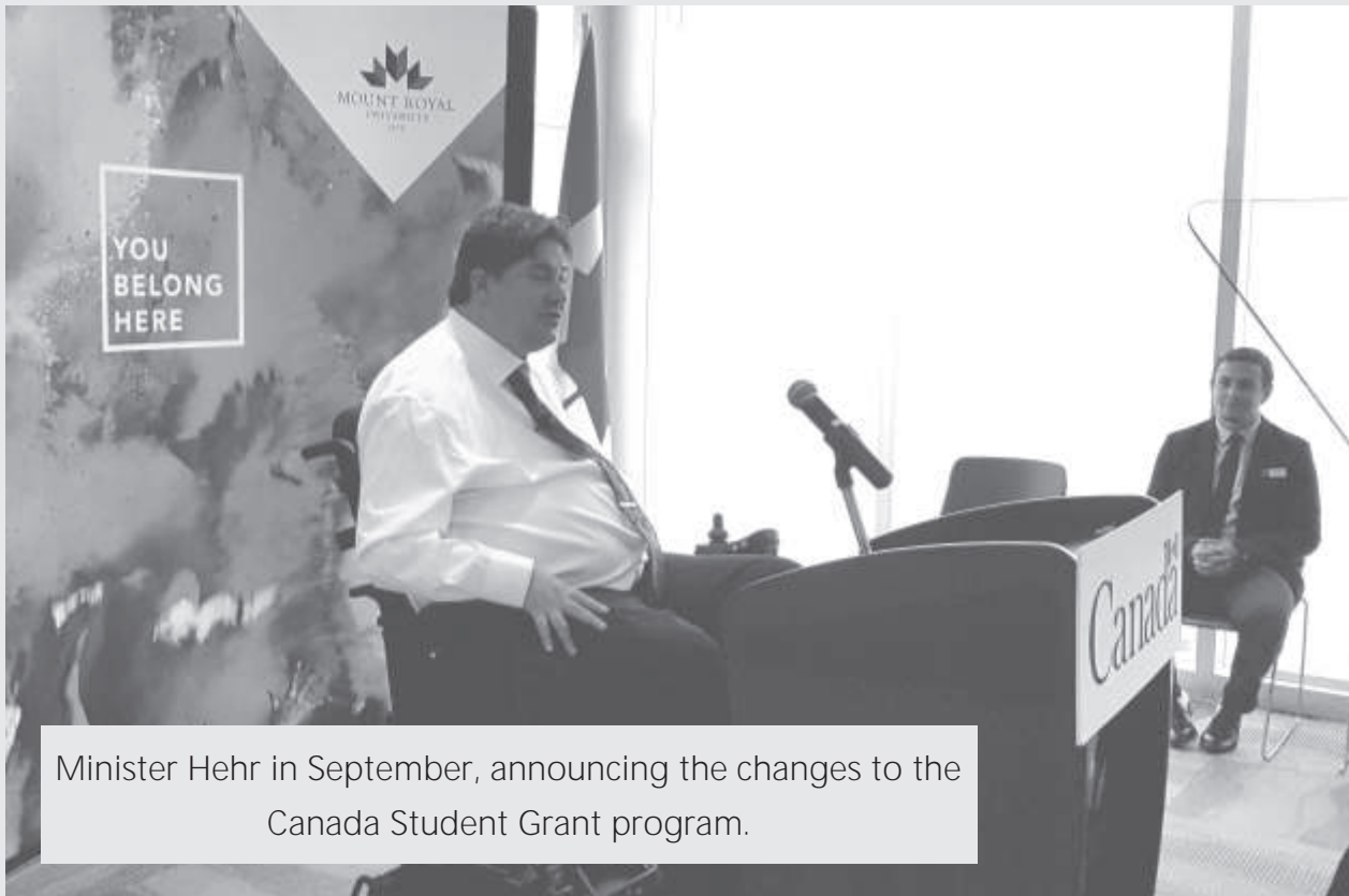
Minister Hehr in September, announcing the changes to the Canada Student Grant program.

Young people can't afford their education and this prevents them from acquiring the skills they need to get a good job and join the middle class.